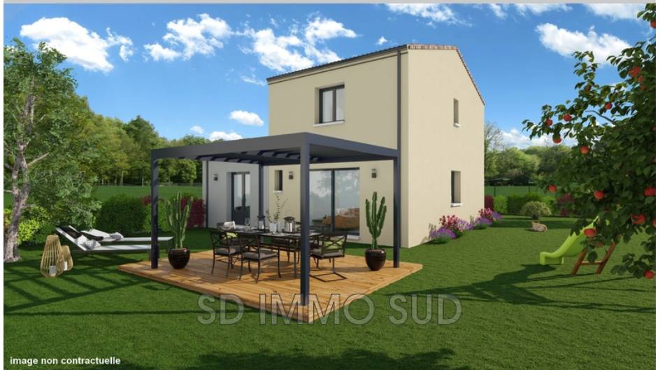
image non contractuelle